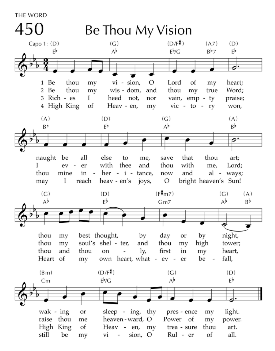
Guitar chords do not correspond with keyboard harmony.

These stanzas are selected from a 20th-century English poetic version of an Irish monastic prayer dating to the 10th century or before. They are set to an Irish folk melody that has proved popular and easily sung despite its lack of repetition and its wide range.